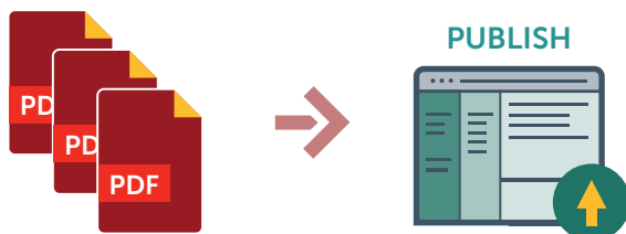
The innovative 2-step PUBLISH process

Eliminate ≥4 publishing tasks per document with LINK